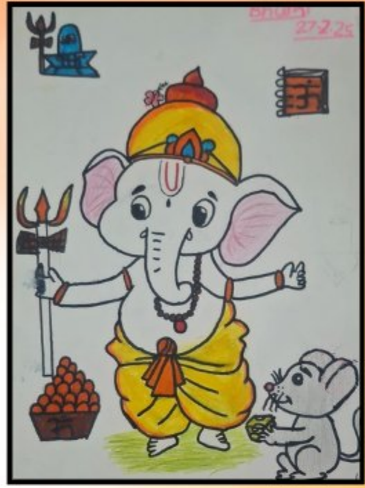
BHUMI CHOUDHARY II-D