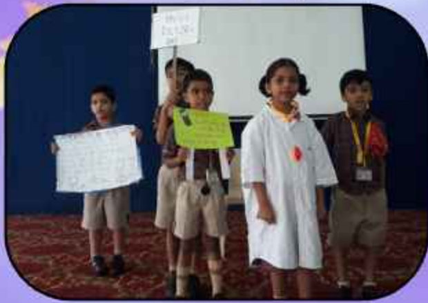
STD I- GRANTH DINDI July 16, 2024