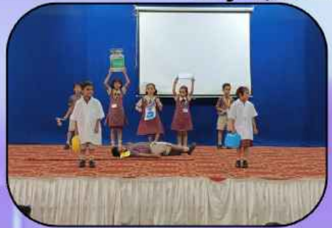
STD I- VRUKSH DINDI July 23, 2024