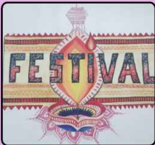
SRISHTEE BANERJEE X E