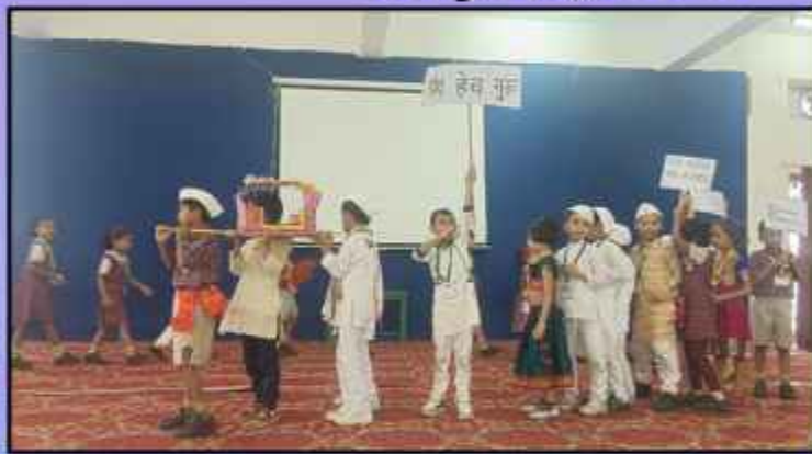
STD II- LOKMANYA TILAK JAYANTI