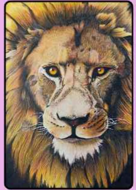
ARNAV PRAJAPATI - XII B